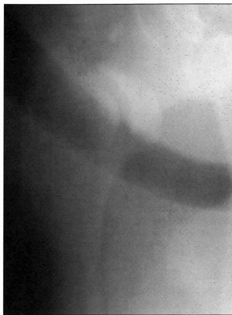
Figure 1—Mediolateral radiographic view of the right scapulohumeral joint of a horse examined because of severe lameness of 6 weeks' duration.