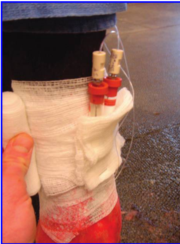
Figure 2—Photograph of 2 evacuated tubes attached to their respective ultrafiltration probes. Ultrafiltration probes were placed in the medullary cavity of the MCIII and in the overlying subcutaneous tissue of the left forelimb of a horse undergoing regional IV perfusion of an antimicrobial agent in that limb. The evacuated tubes were used to create the negative pressure necessary to collect interstitial fluid from the bone marrow cavity and subcutaneous tissue space. The horse's head is to the left of this image.

stab incision was made through the skin, subcutaneous tissue, and periosteum on the proximolateral aspect of MCIII, approximately 4 to 5 cm below the carpometacarpal joint. Access to the medullary cavity was achieved by drilling a